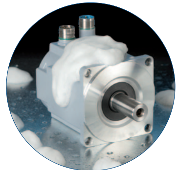
Washdown AKM servomotors are well suited for wet and frequently cleaned environments.