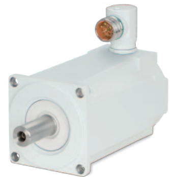
AKM Washdown and AKM Washdown Food-grade motors are also available with one cable connection as part of Single-Cable packaged solutions from Kollmorgen.